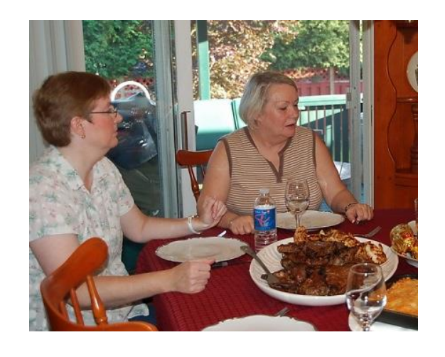
'Going to the Dogs' planning meeting, 2017

Like I said in the first part of the letter, your knowledge of dogs etc. is amazing. You are a very good teacher.