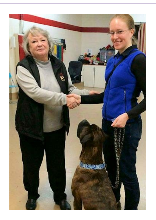
Presenting a CCGC test award, 2015