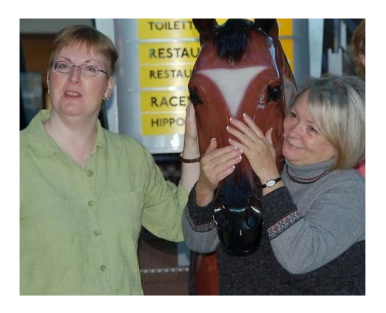
The morning after 'Going to the Dogs'